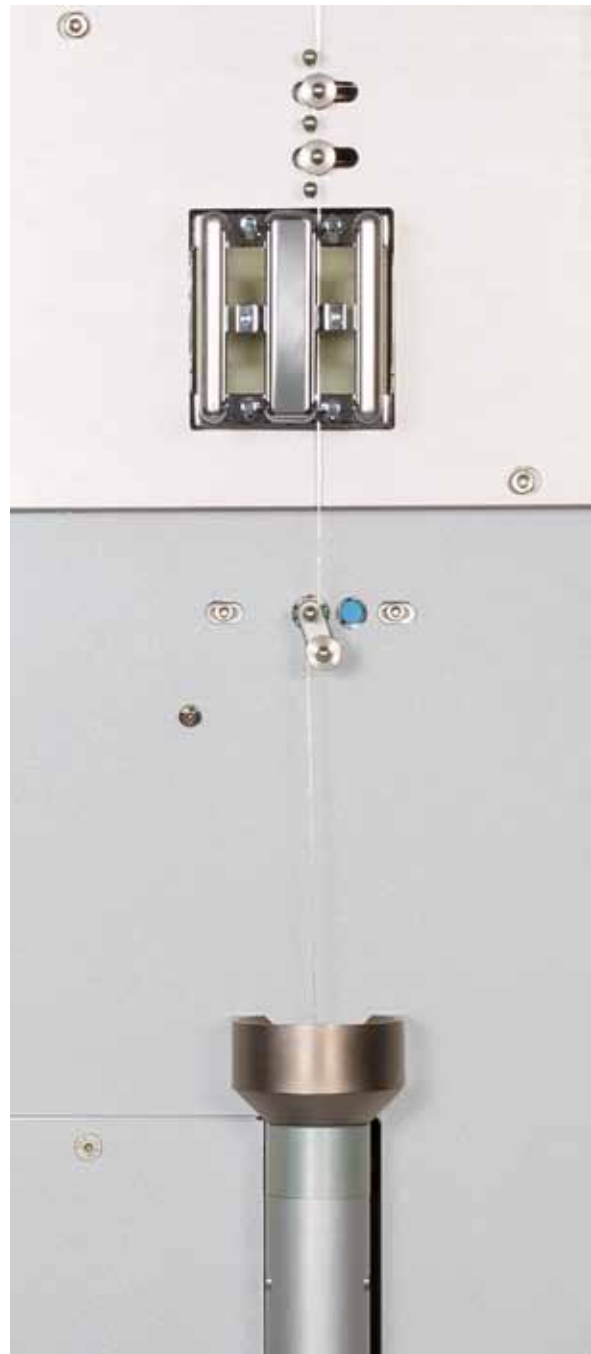
Sensor with Twister