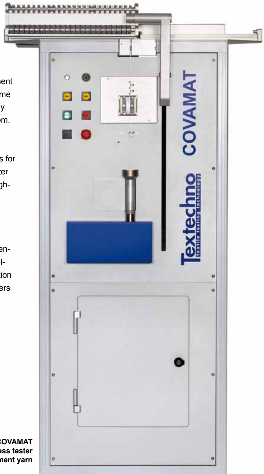
COVAMAT Automatic capacitive evenness tester for filament yarn

As an alternative, the COVAFIL+ capacitive evenness tester without package change is still available either as a stand-alone unit or in combination with Textechno's well-proved filament yarn testers DYNAFIL ME+ and COMCOUNT.